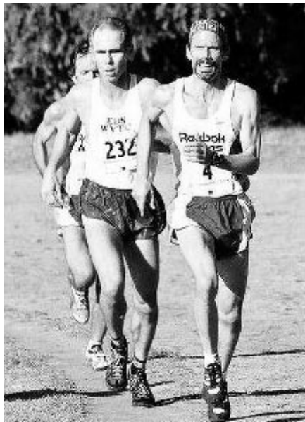
Thom battles Aggies at halfway point in XC Championships