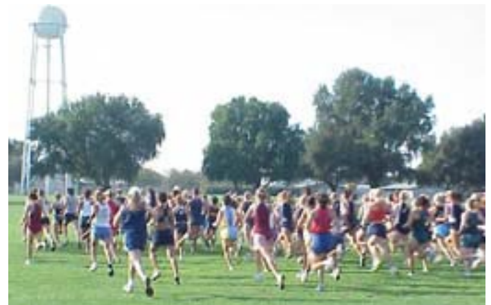
Aggie Invite XC - UC Davis